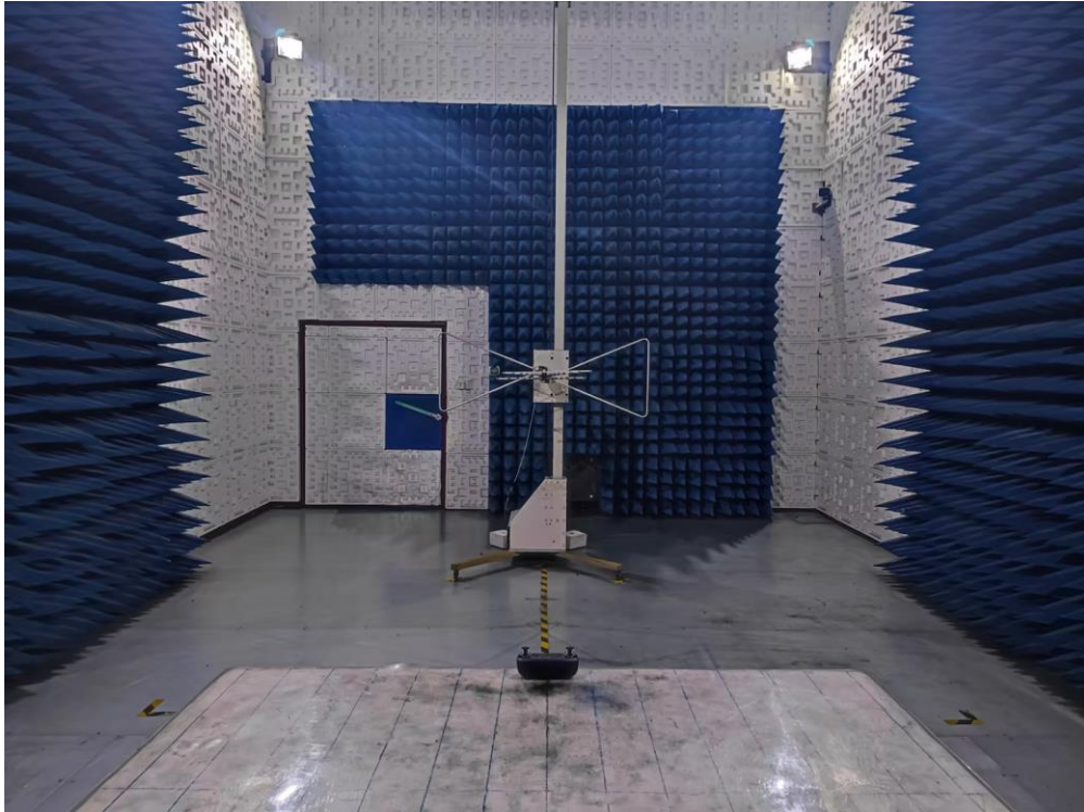
RADIATED EMISSION TEST SETUP ABOVE 1GHz