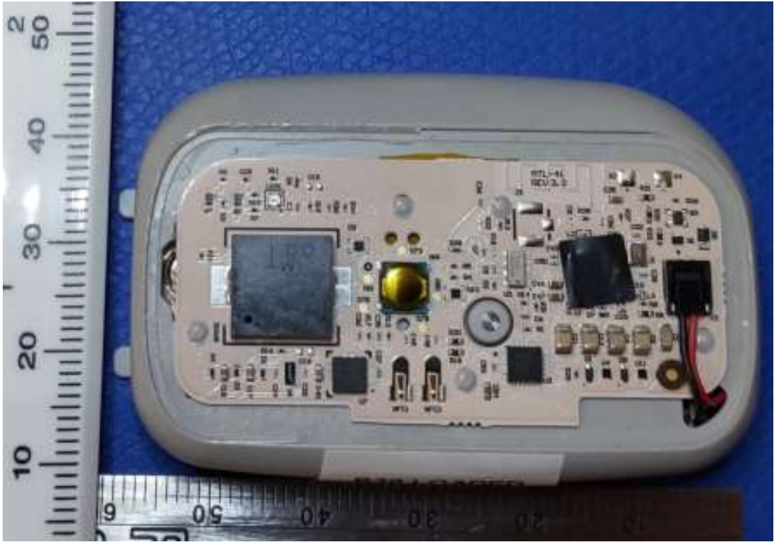
Fig 3 PCBA placement in host