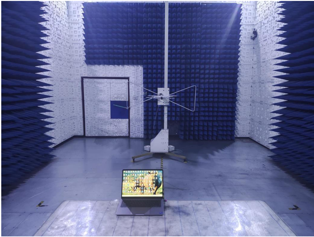
RADIATED EMISSION TEST SETUP ABOVE 1GHz