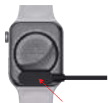
The magnetic cable is charged

Charging instructions: If you use the watch for the first time if the battery is exhausted, please take out the charging cradle, the watch will automatically absorb the charging cradle, and plug the USB into the adapter for charging. The adapter input voltage is required to be 5V1A/2A.