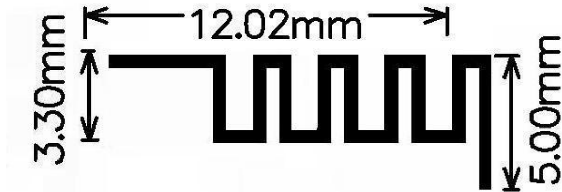
Antenna Photo & Length (mm)