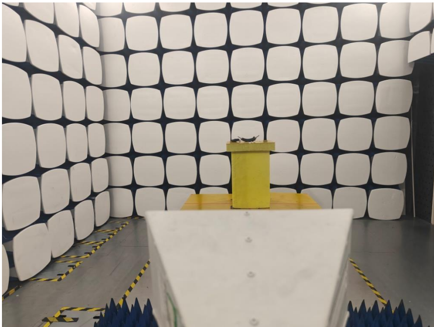
Radiated Spurious Emission: 1GHz-18GHz