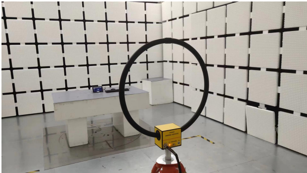
Radiated Emissions for 9kHz~30MHz