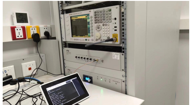
Conducted for RF