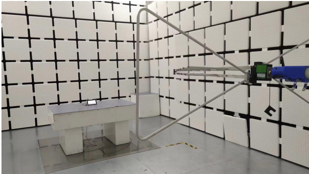
Radiated Emissions for 30MHz~1GHz