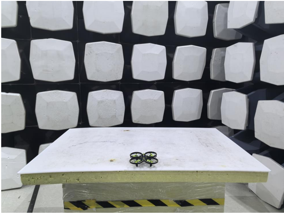
Up to 1GHz (EUT was placed in the centre of the turntable)