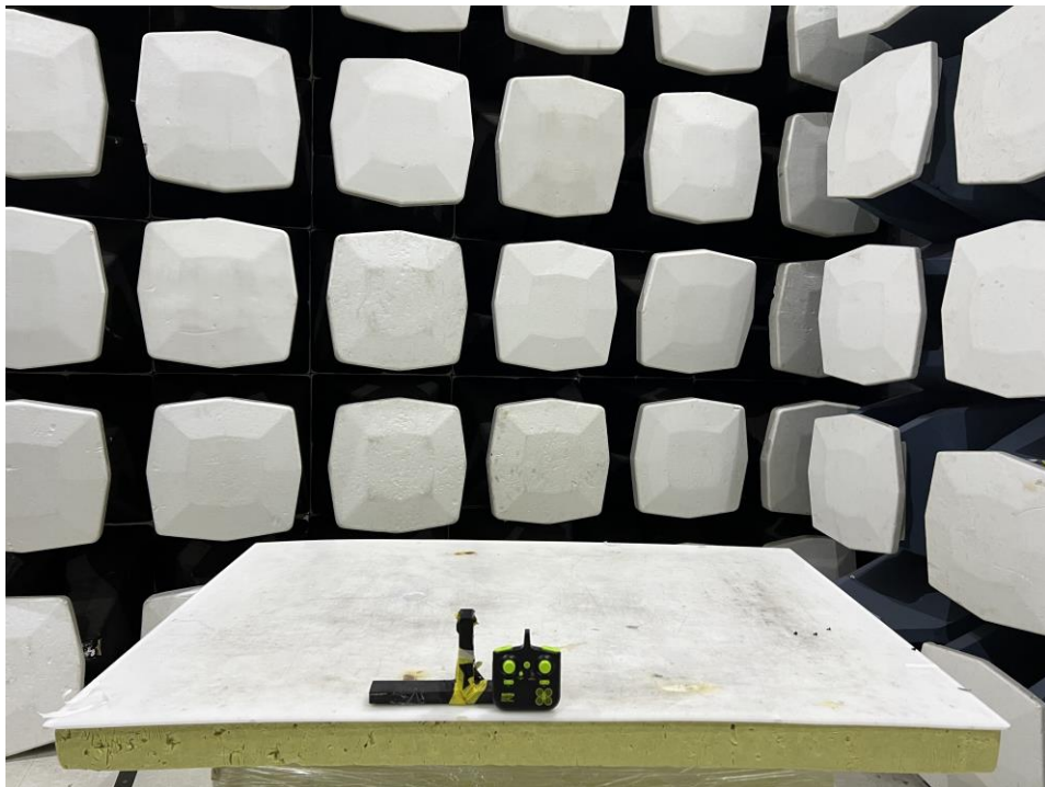
Up to 1GHz (EUT was placed in the centre of the turntable)