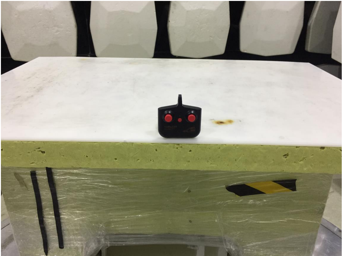
Up to 1GHz (The EUT placed at the center of the turntable)