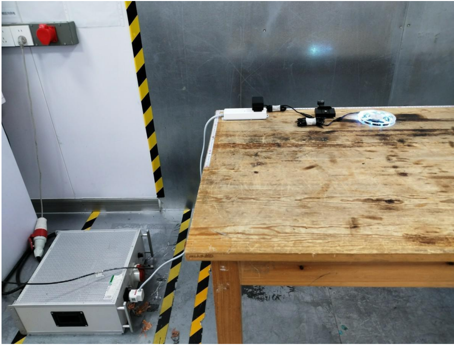
Emissions in frequency bands (above 1GHz)