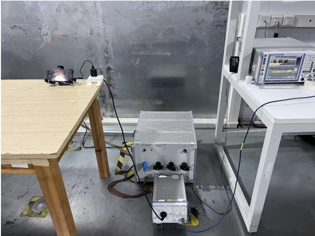
Radiated Emission below 1GHz-AC adapter charge mode