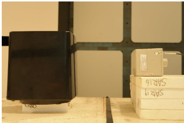
Bottom Side @ 20cm separation distance