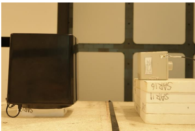
Left Side @ 20cm separation distance