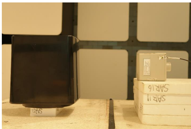
Right Side @ 20cm separation distance