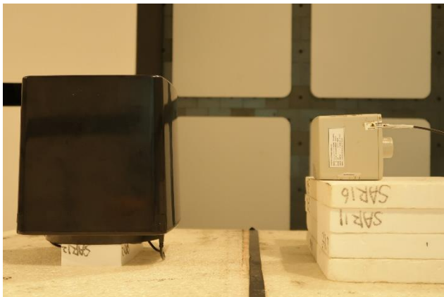
Top Side @ 20cm separation distance

The equipment under test was placed on a wooden desk inside of shield room. The isotropic field probe was used to measure the field strength for 5 EUT surfaces, RF exposure evaluation at 20 cm from the surface, the separation distance is maintained between EUT and the center of the field probe. (The Probe to shell is 8 mm)