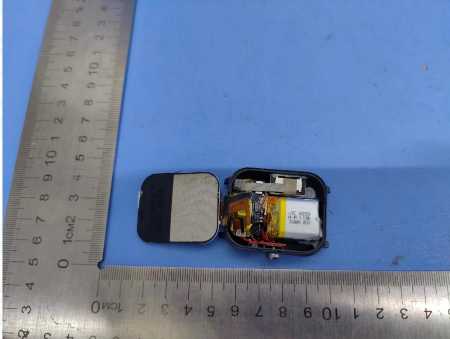
Photo 8 Appearance of PCB