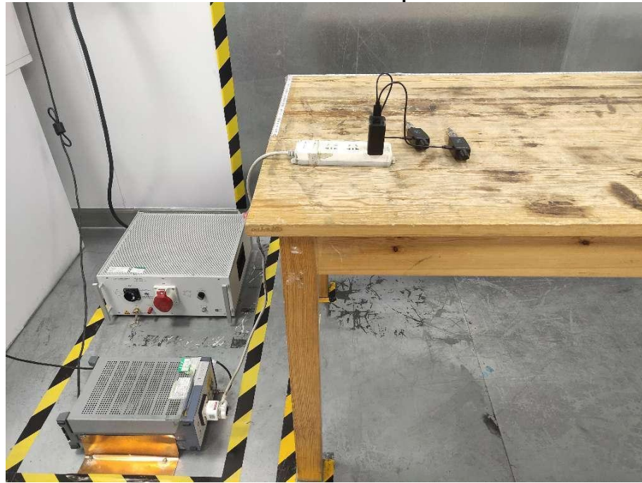
RADIATED EMISSION MEASUREMENT(30M-1GHz)