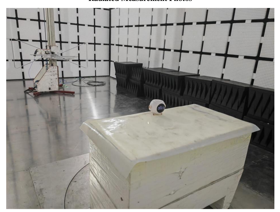
Radiated Measurement Photos