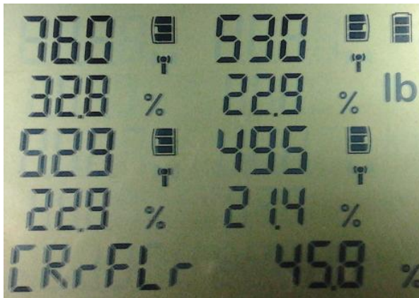
Cross Right Front, Left Rear percent