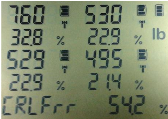
Cross Left Front, Right Rear percent