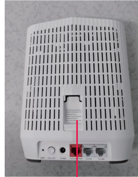
Device label 2 22*19.5mm

Manufacturer: HEIGHTS TELECOM T LTD Ha-Sakhlav 6, Irus, Israel Country of Manufacturing: Vietnam Year of manufacturing: 202X