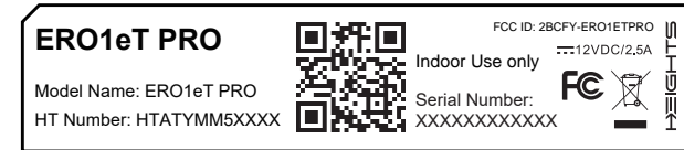
Device label 1 79.5*17.5mm