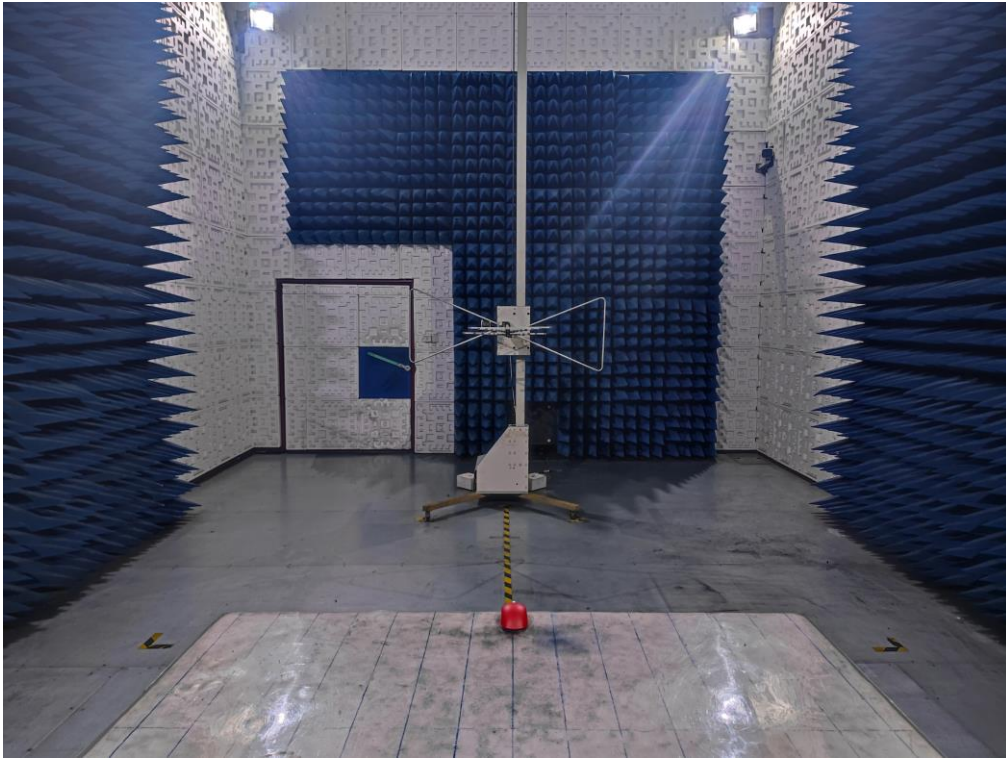
RADIATED EMISSION TEST SETUP ABOVE 1GHz