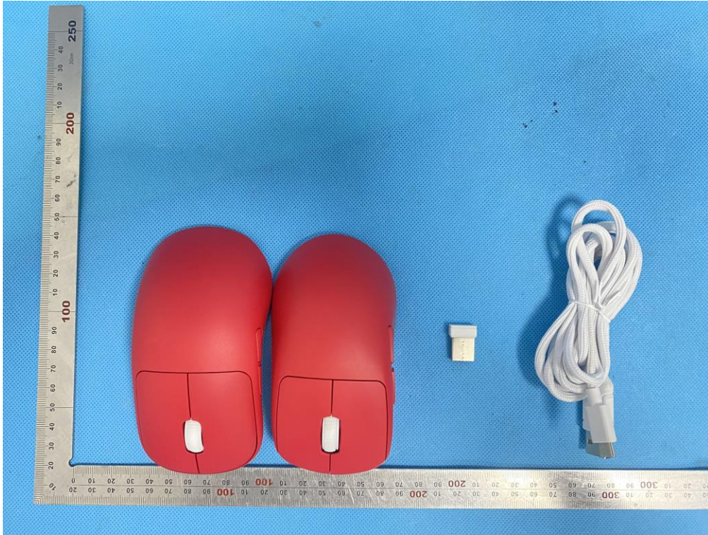
Test Model: WGM832(OGM CLOUD) TOP VIEW OF EUT