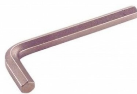
Figure 1.4. 1 x 3mm Allen key