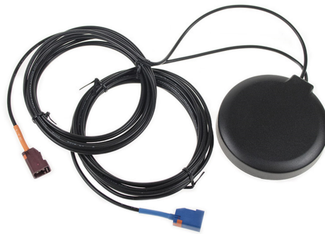
Figure 1.2. 1 x GNSS and 4G LTE combination antenna