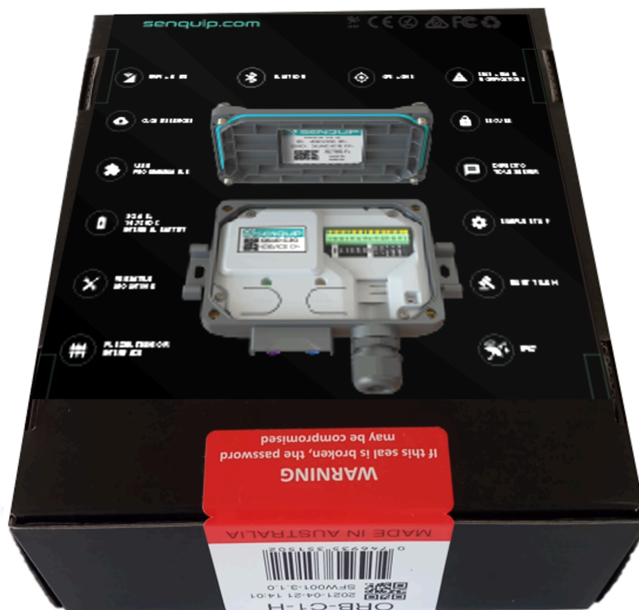
Figure 2.1. Senquip QUAD packaging with intact security seal

The Senquip QUAD is shipped in a box with a security seal that ensures that the packaging has not been opened. If this seal is compromised, the box may have been opened, in which case, a non-authorised party could have had access to the device password. If the device is to be used in a critical application, please ensure that the seal is intact upon receipt and remember to change your password as soon as possible.