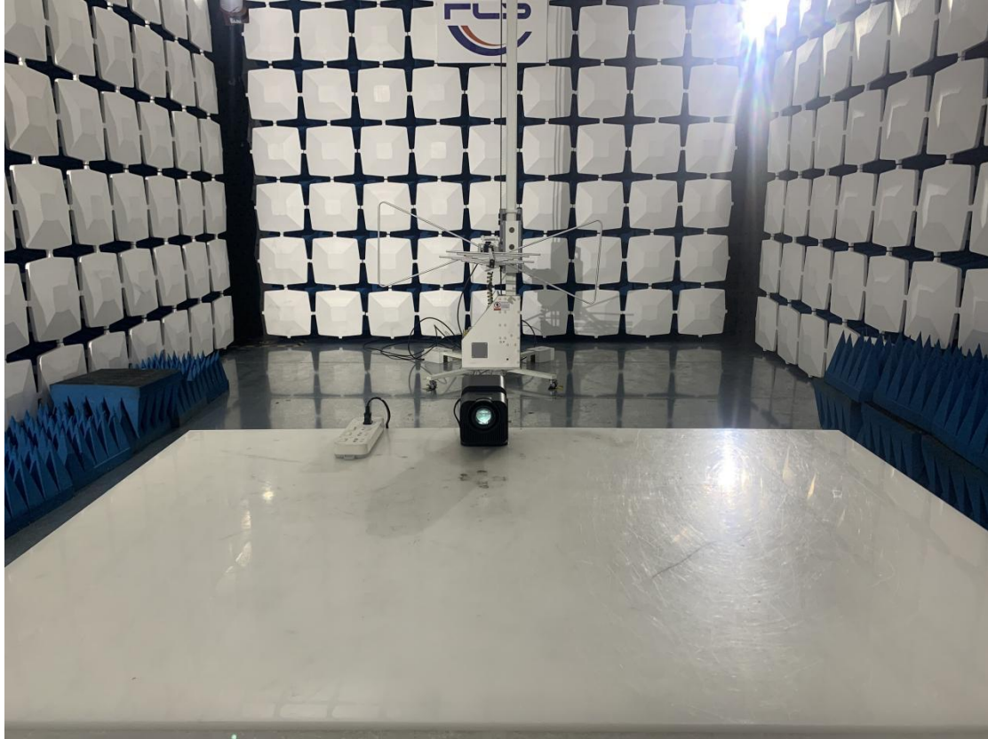
Below 1GHz for radiated emission test setup