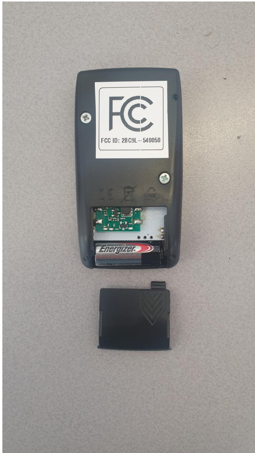
Figure 1 - Battery