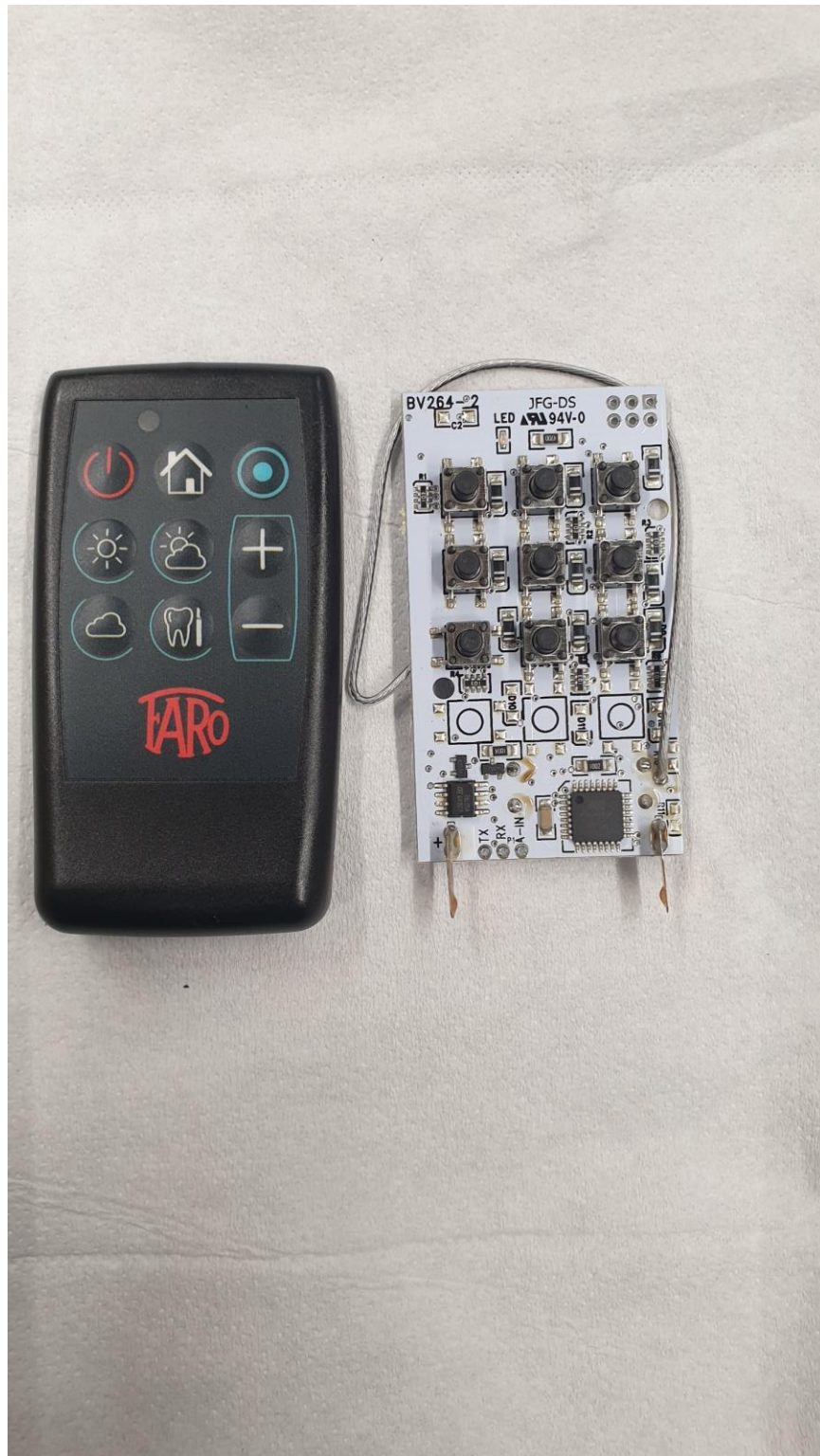
Figure 2 - Front Digital Circuitry