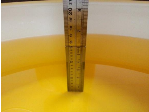
Photo 1: Tissue Simulant Liquid for Head 2300-2500