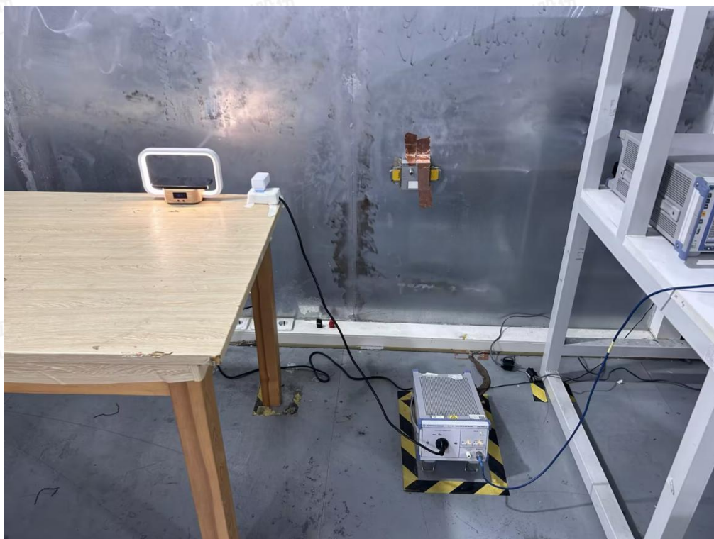
Radiated Emission below 1GHz-AC adapter charge mode