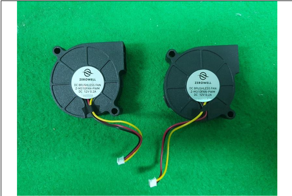
<fan rear View>