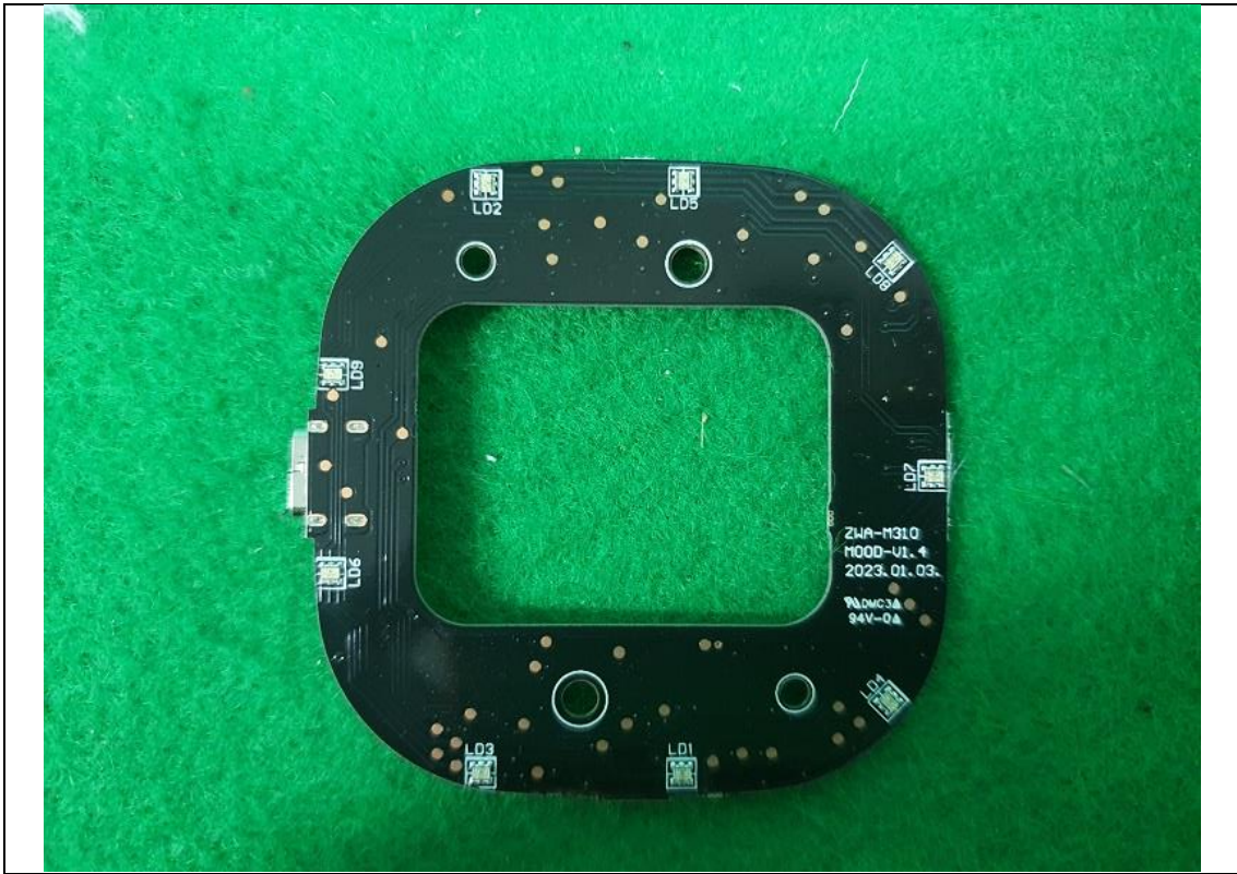
<Sub PCB2 rear View>