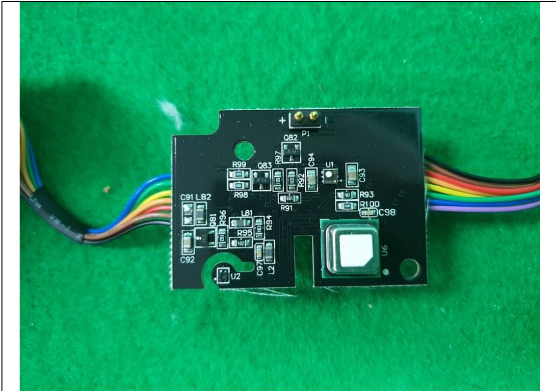
< Sub PCB rear View >