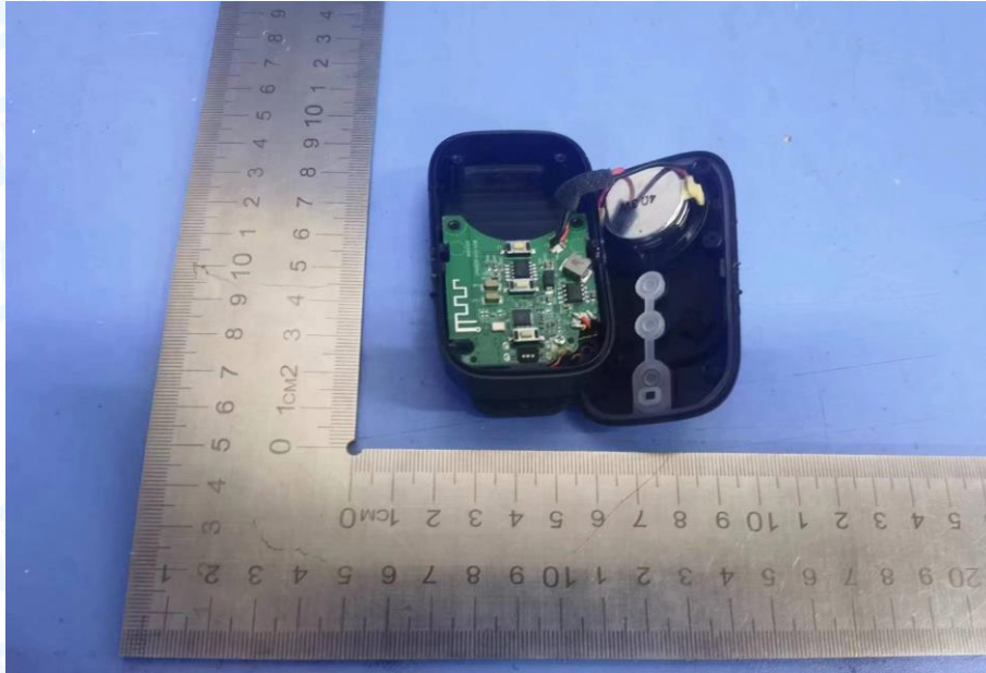
Photo 10 Battery parameters