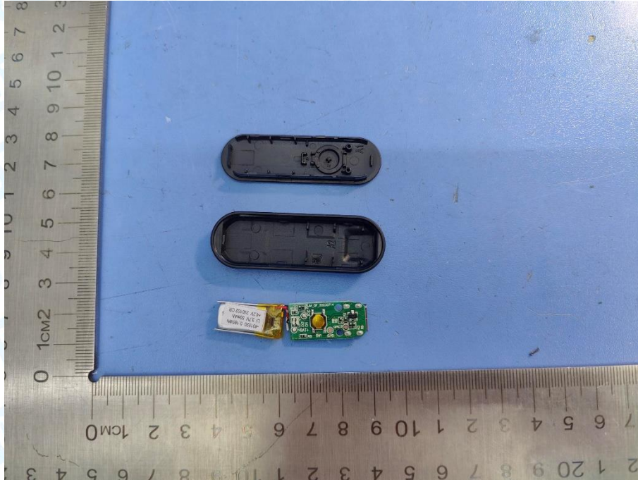
Photo 8 Appearance of PCB