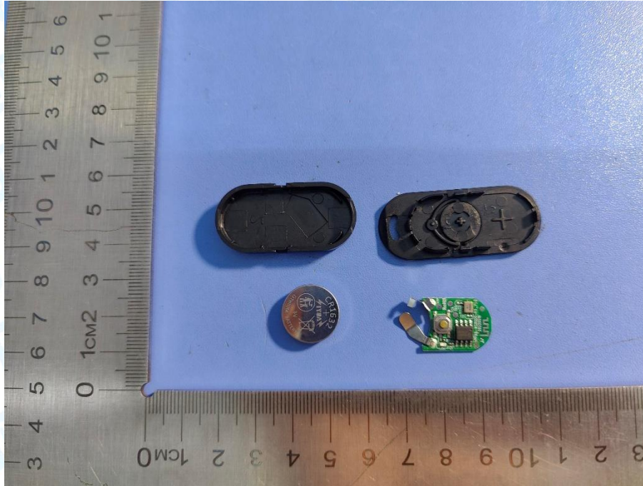
Photo 8 Appearance of PCB