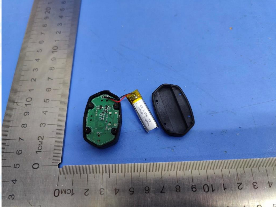
Photo 7 Appearance of PCB