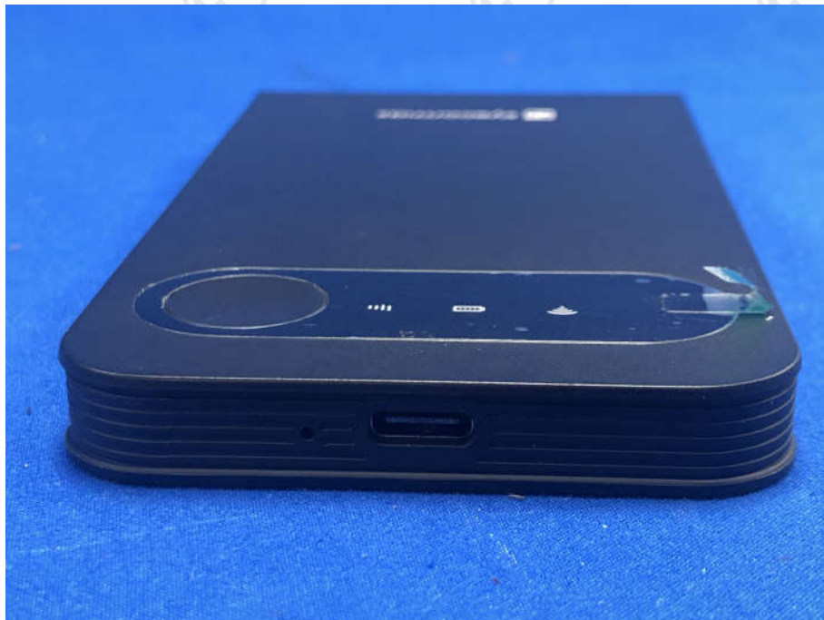
View of Product-6