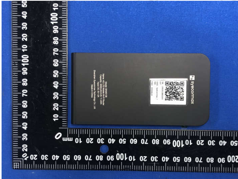
View of Product-3