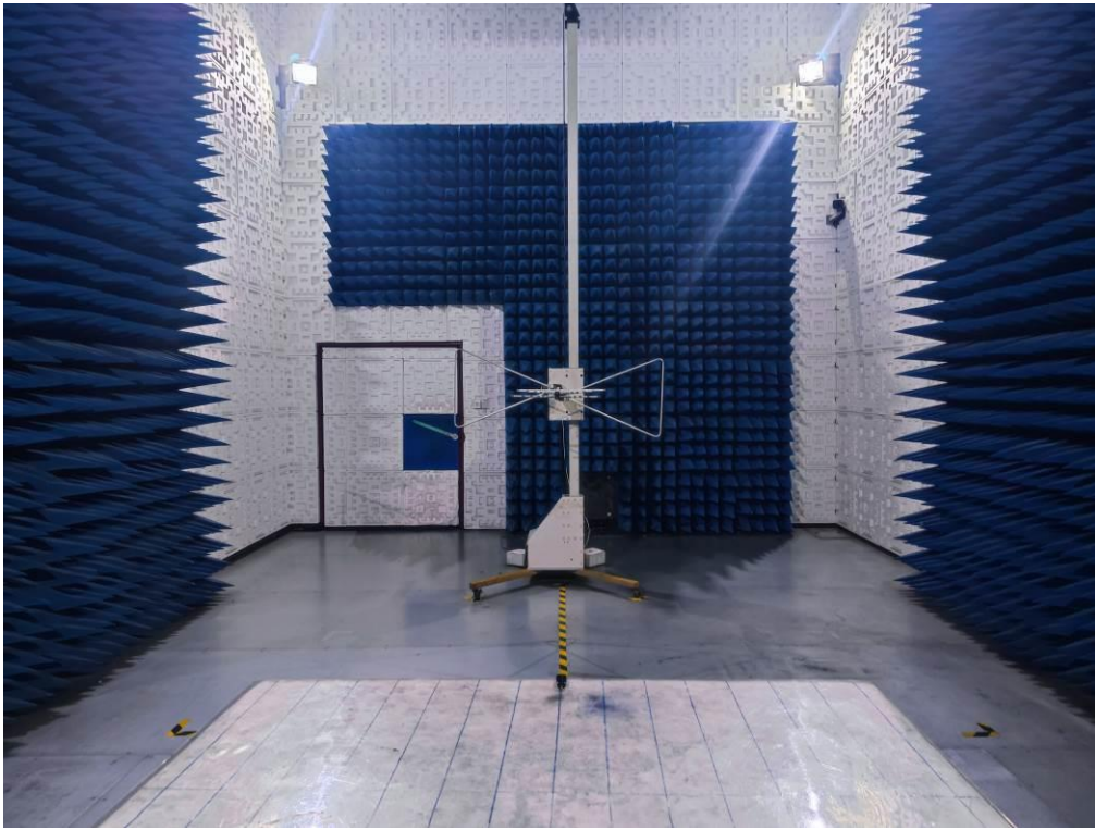
RADIATED EMISSION TEST SETUP ABOVE 1GHz