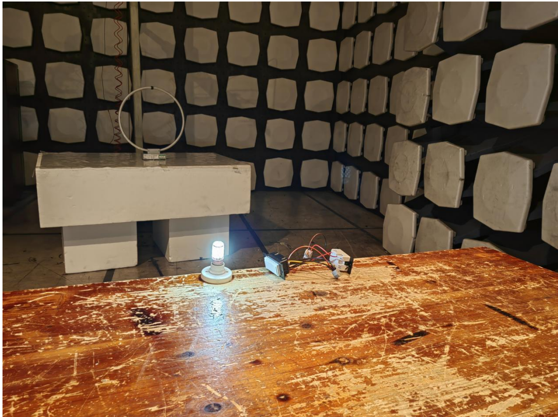
9kHz to 30MHz Radiated Spurious Emissions