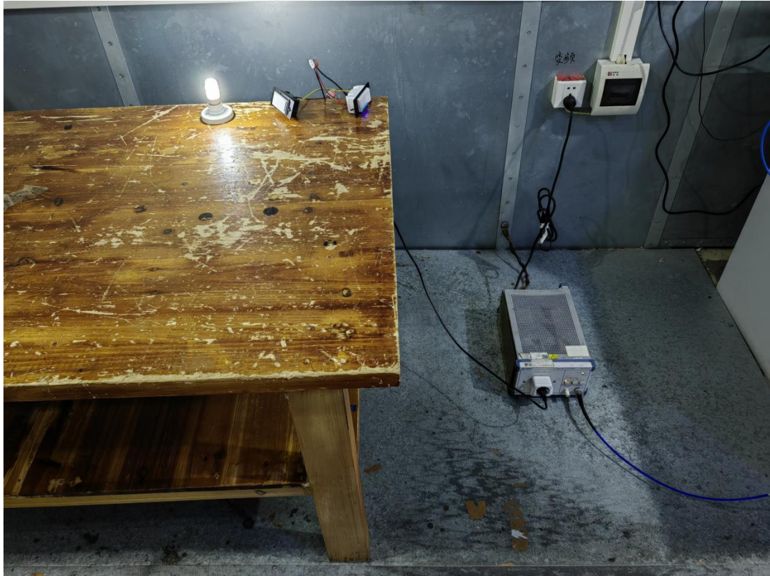
Conducted Emissions at Mains Terminals 150 kHz to 30 MHz