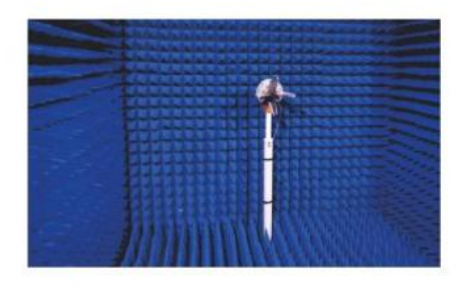
OTA-800 品牌: ETS✔ 频率范围: 370MHz-8.5GHz

功能: 无源、有源测试; G网、C网、2G/3G/4G, WIFI, BT等制式TRP、TIS测试。