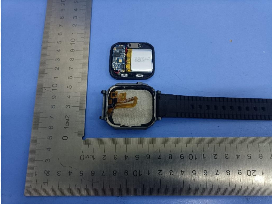
Photo 8 Appearance of PCB