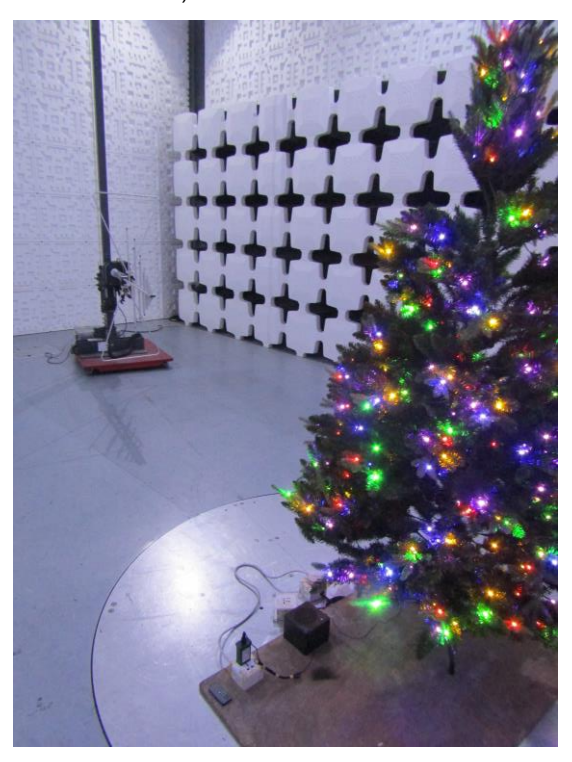
Radiated Emission (Above 1000MHz)

Note:EUT is positioned at the center of the turntable to keep 3 m between the measurement antenna and EUT for the radiated emissions measurements Radiated Emission (30MHz-1000MHz)