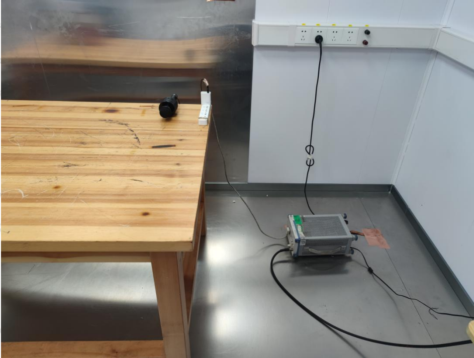
Photo of Radiation Emission Test