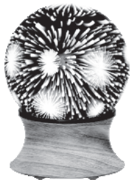
Operation Manual PY-FPRI-WOD