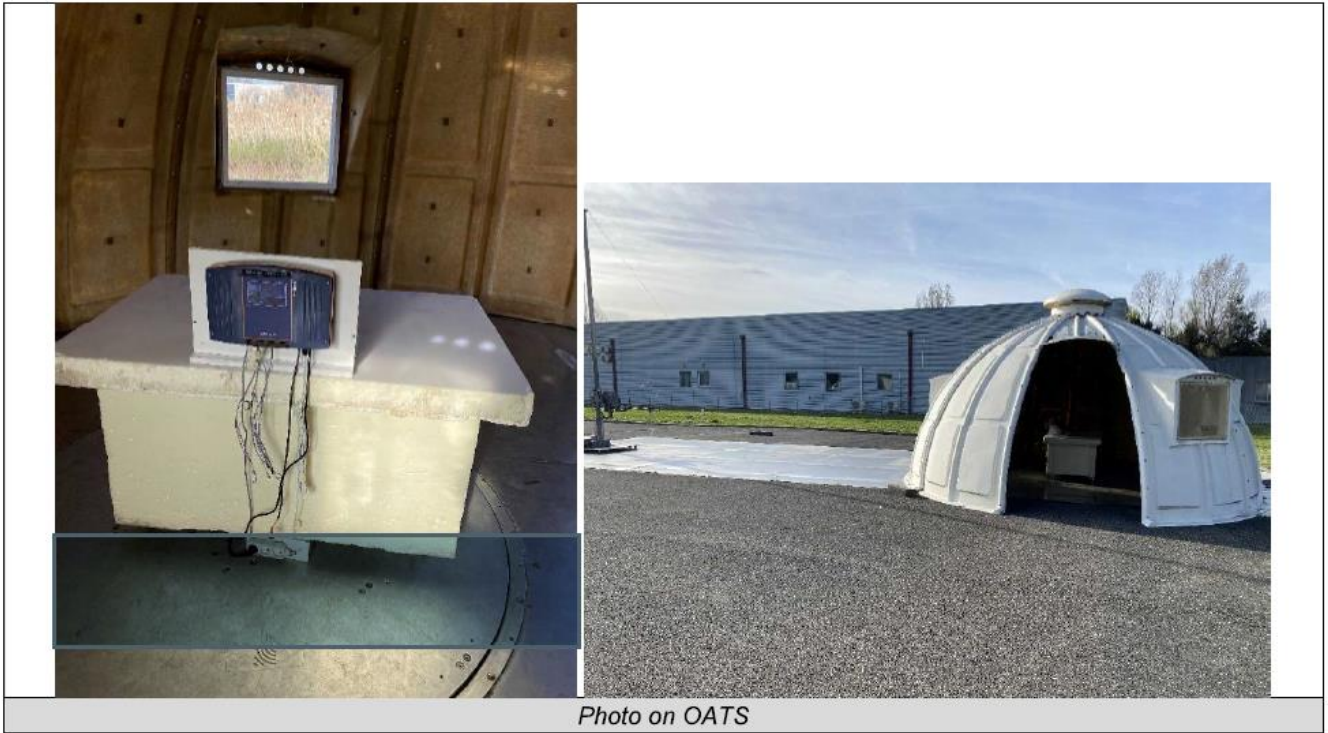
Photo on OATS