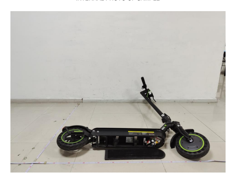
INTERNAL PHOTO OF SAMPLE