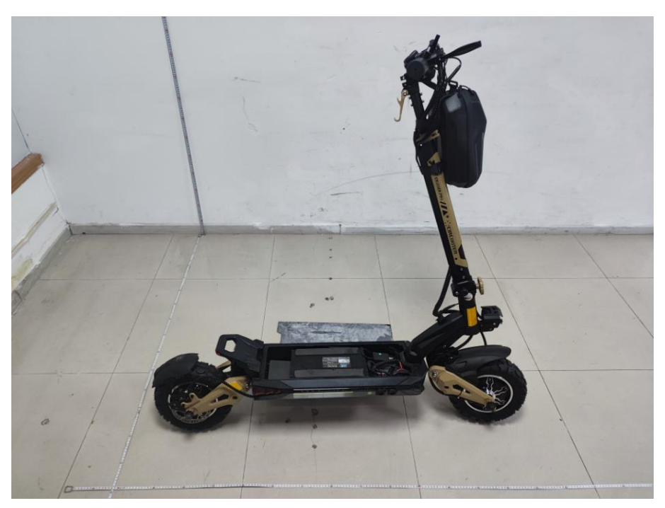
INTERNAL PHOTO OF SAMPLE