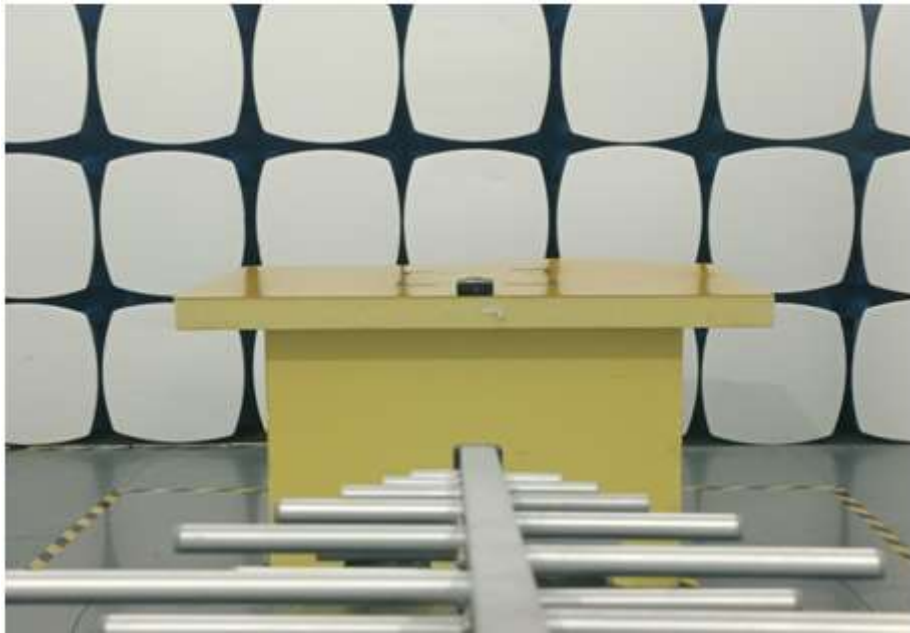
30MHz - 1GHz