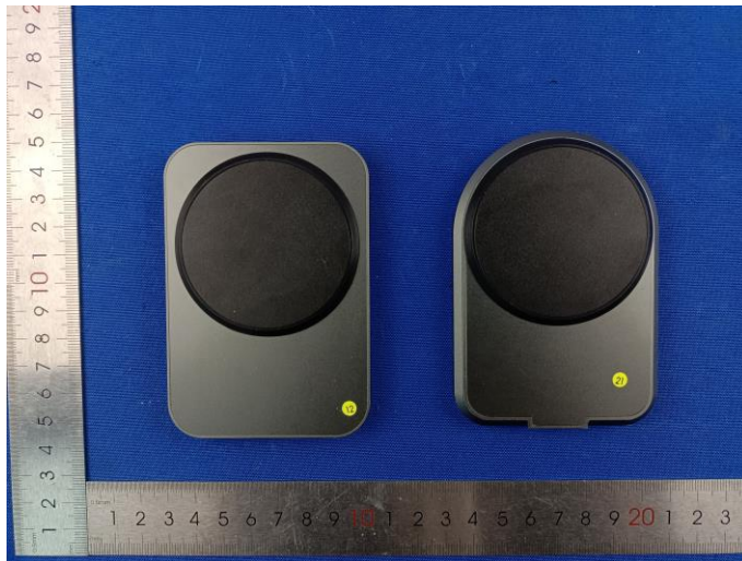
(Left: MT-MWC01, Right: MT-MWC02)

Demonstrate the detail (descriptions and pictures) as to the difference list above.