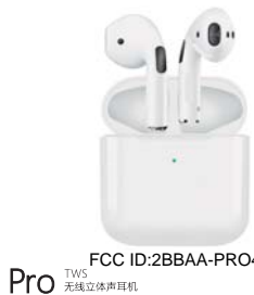
Pro TWS 无线立体声耳机 FCC ID:2BBAA-PRO4