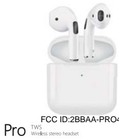
Pro TWS Wireless stereo headset FCC ID:2BBAA-PRO4