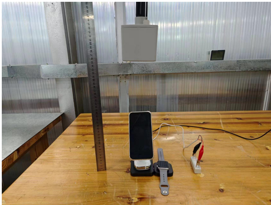
Test Position E-20cm from the edge of EUT to the geometric center of the probe