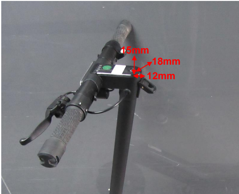
The BLE Antenna to enclosure minimum Distance (12mm)