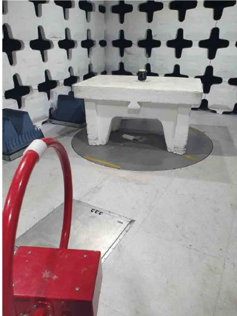
Picture # 6. Radiated Emission test setup below 30 MHz. Figure 5 - Radiated Emission test setup below 30 MHz