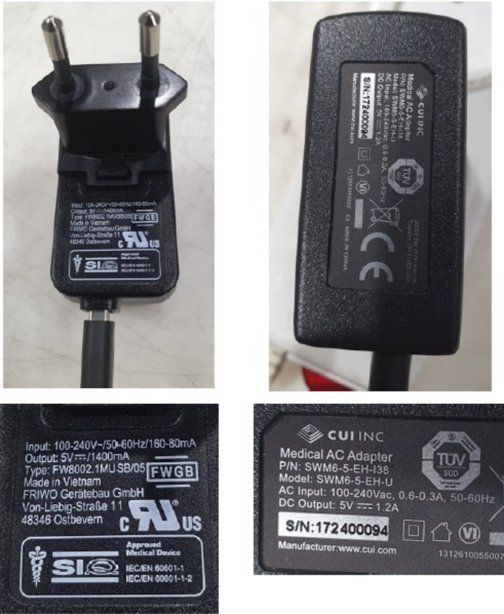
Power Adapter 1