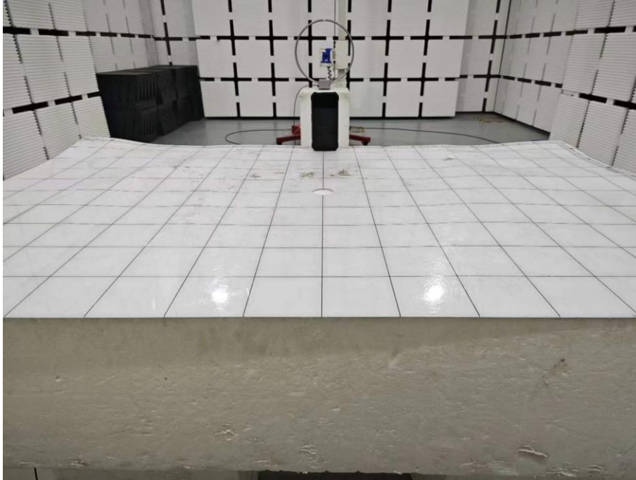
Set-up for Transmitter & Receiver Spurious Emissions, 30MHz to 1000MHz