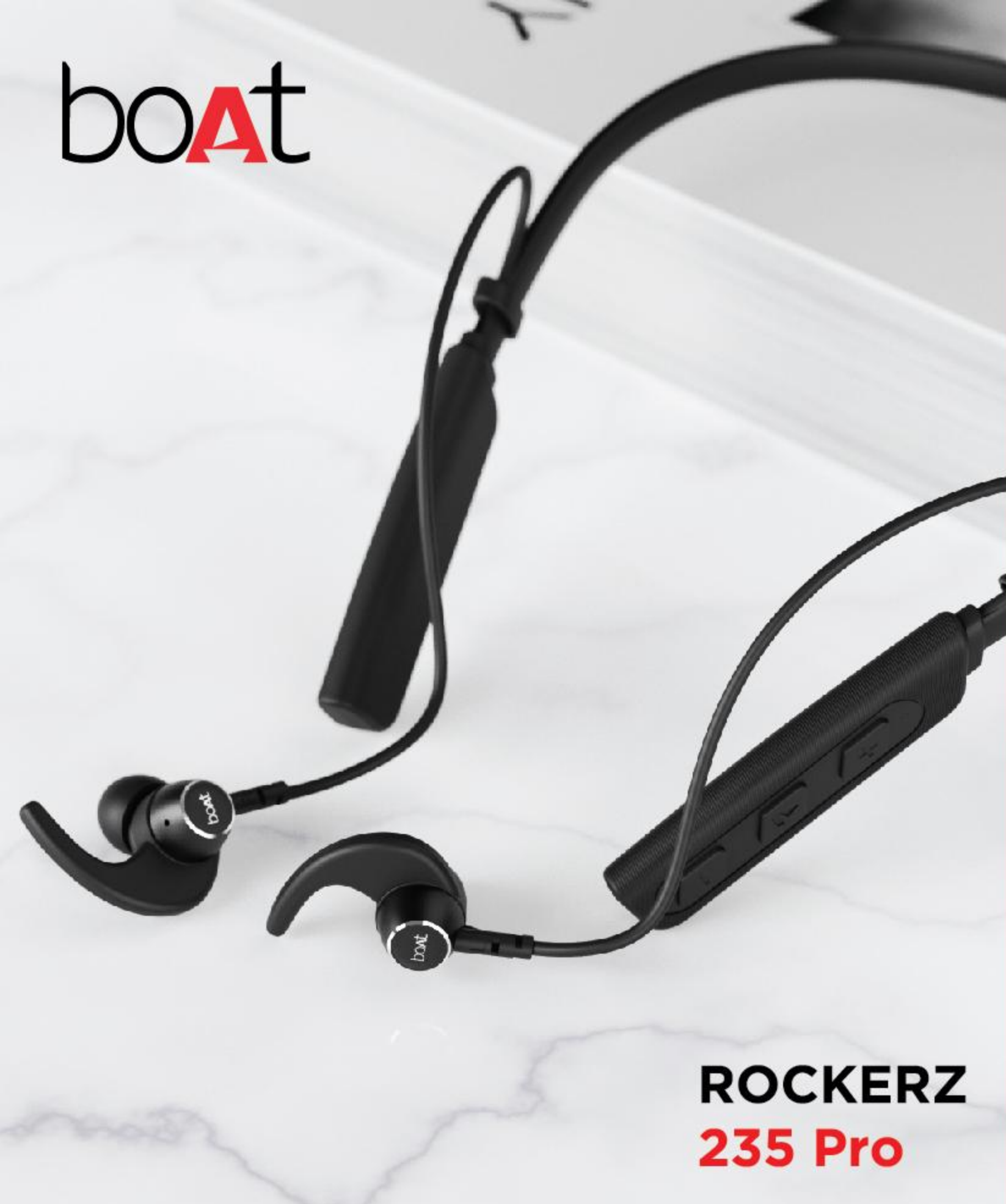
ROCKERZ 235 Pro